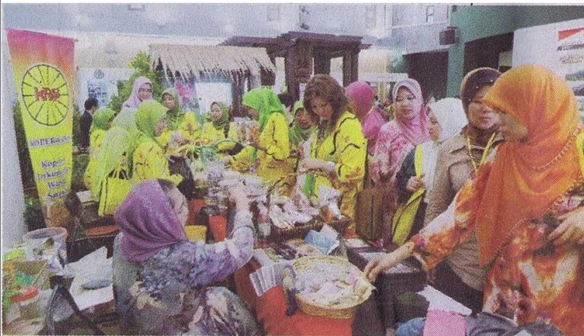
VISITORS at one of the booths at the exhibition.