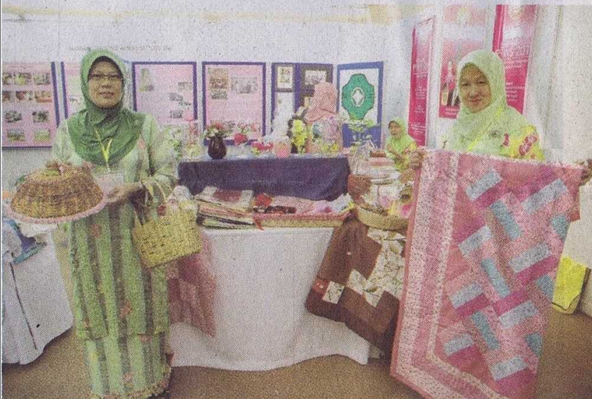
HANDICRAFTS by SFWI members displayed at their booth.