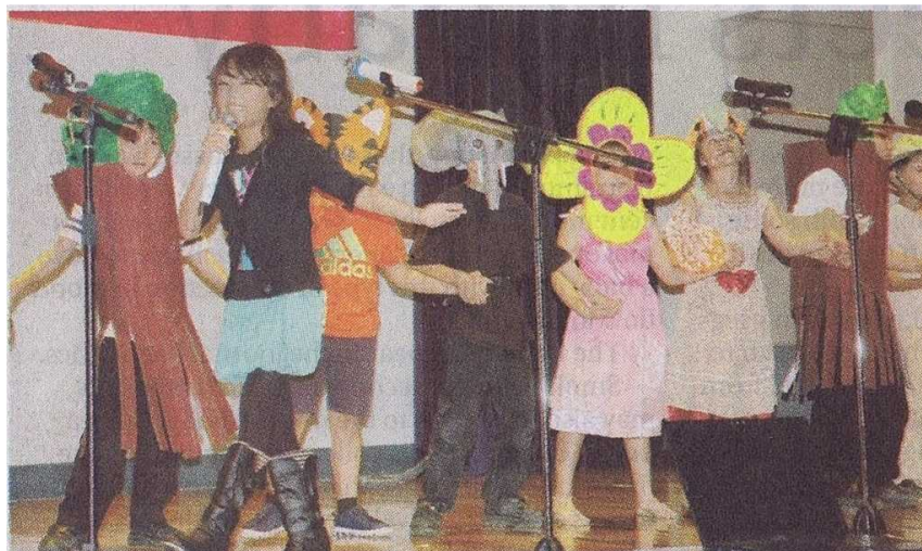
TUNKU Putra School students performing at the opening of the seminar.