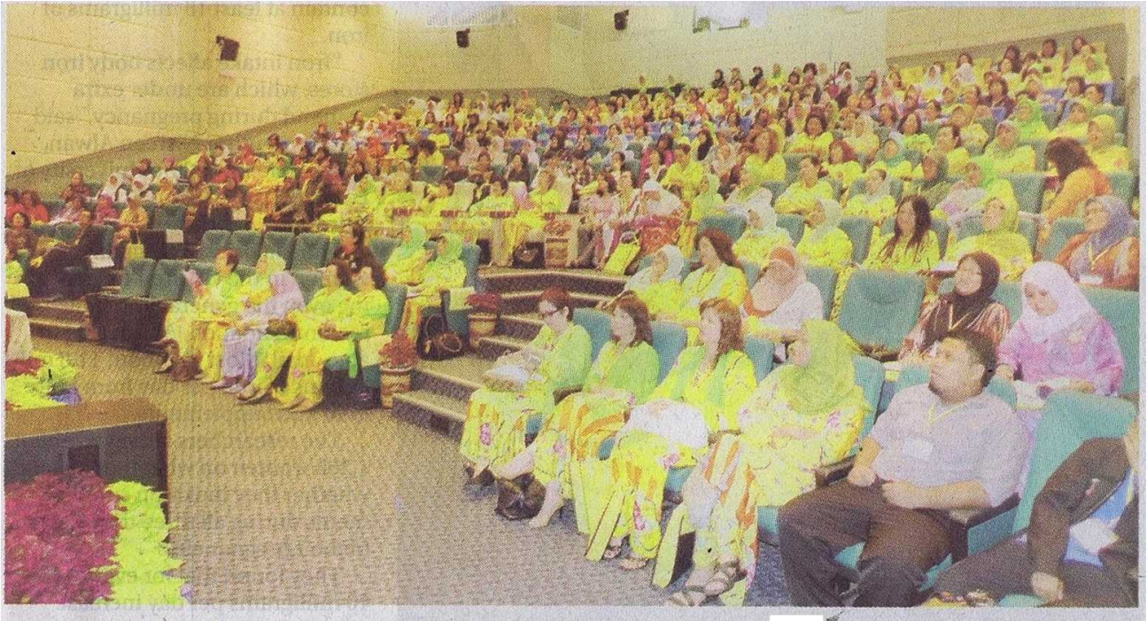
A section of the participants in the auditorium during the opening of the seminar.

Language English Page No T1 Article Size 975 cm 2 Color Full Color ADValue 4,107 PRValue 12,320